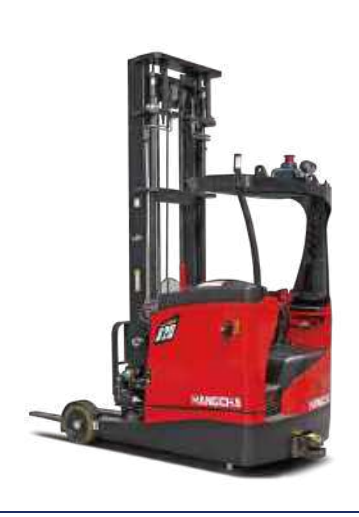
Narrow Aisle Tri-directional AGV