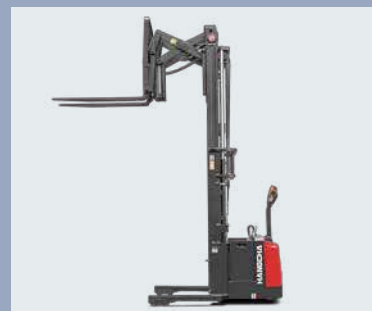
Travel speed is lowered automatically when fork is lifted to specified height