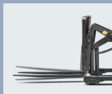
Mast tilting function is easy for entry in/out the pallet