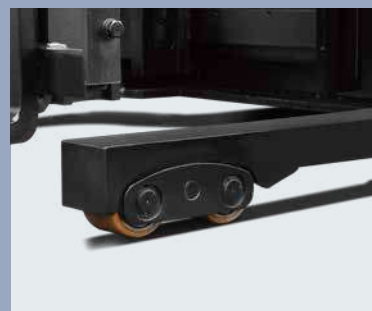
The structure of rotary load wheel offers the truck better passing ability