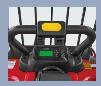
The CURTIS AC control system offers accurate and stable work, and higher efficiency