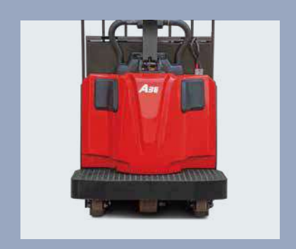
The roomy platform features low steps heights to reduce fatigue, and cushioned lean pads (Opt.) allow the operator to adjust stance throughout the shift, enhancing operator comfort