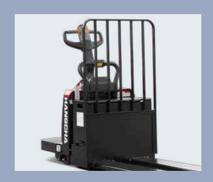
The load backrest is secured with high-strength bolts, which can protect the operator effectively