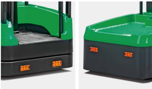
Front and rear flashing lights