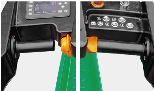
Right and left hand sensing